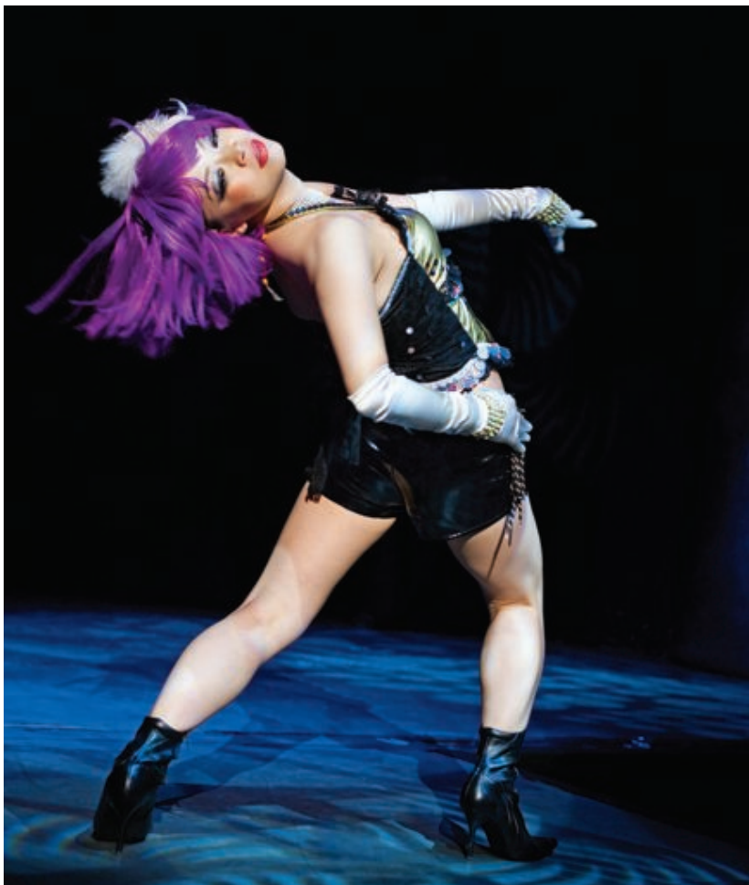
Above: Vima Burlesque (San Francisco).