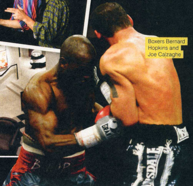
Boxers Bernard Hopkins and Joe Calzaghe