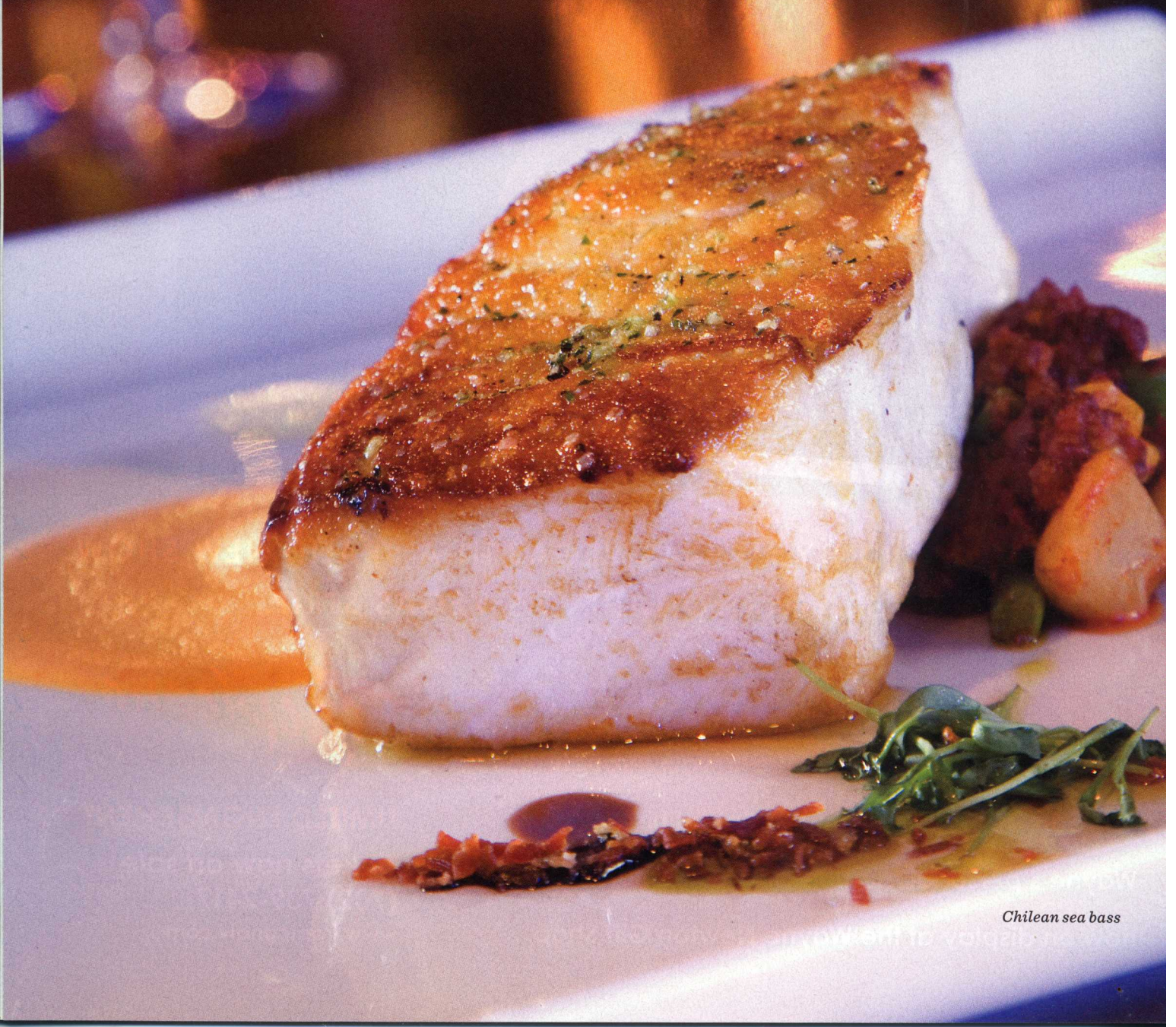
Chilean sea bass

BY E.C. GLADSTONE Bayou cuisine won't leave you blue