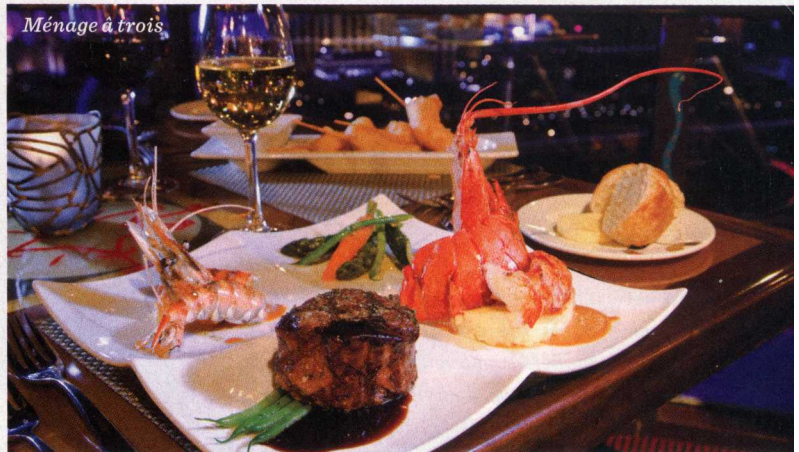
Ménage à trois