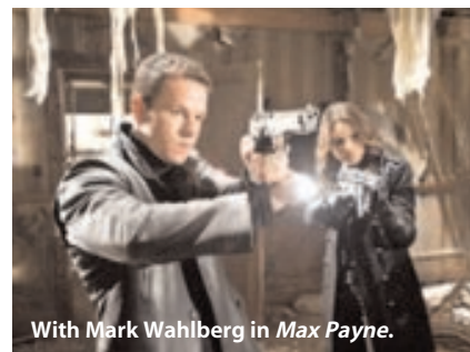
With Mark Wahlberg in Max Payne .

Kunis is currently shooting Extract , a comedy written and directed by Mike Judge that also stars Jason Bateman, Ben Affleck