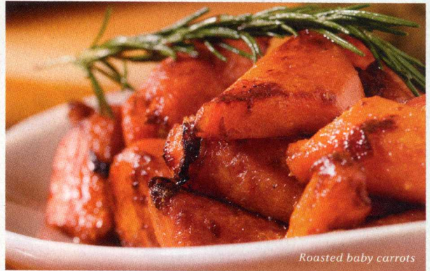
Roasted baby carrots