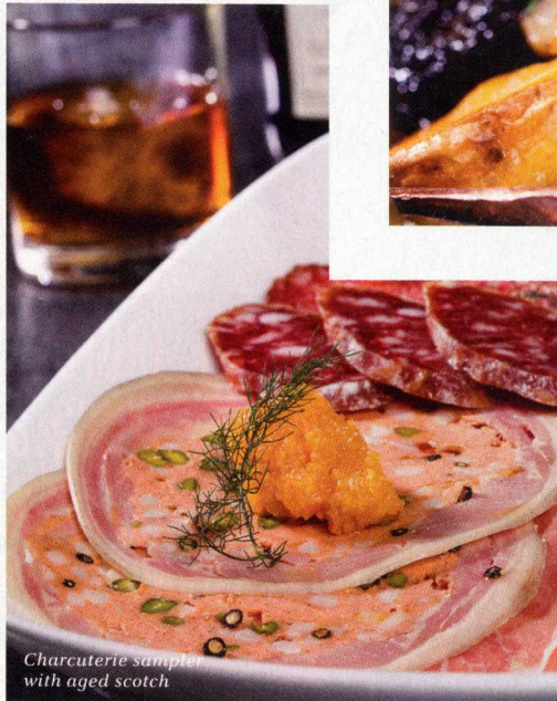
Charcuterie sampler with aged scotch