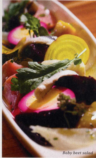
Baby beet salad